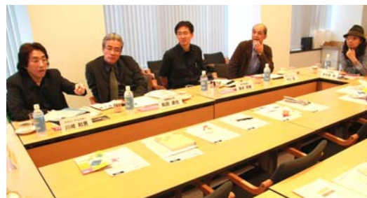
Scenes from selection meeting